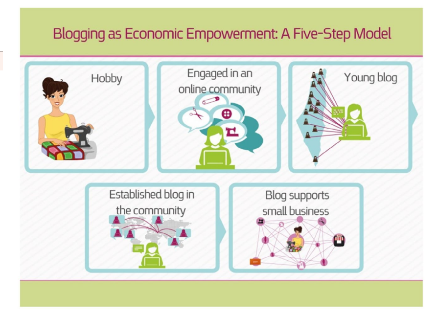
Figure 1. Blogging as economic empowerment: A five-stage model.